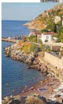
Below: Kamini Beach. Right: the Pirate Bar