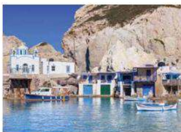
Above: the traditional fishing village of Firoptamos