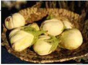
Above: Santorini aubergines. Right: Opson Restaurant at the Andronis Arcadia hotel. Far right: a typical church in Oia village