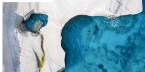
Chalk rock formations of Sarakiniko. Above: a bentonite quarry