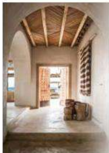
From top: the Belvedere Hotel, home to Matsuhisa Mykonos; the ancient ruins of Delos, the mythical birthplace of Apollo and Artemis; Scorpios, one of the island's coolest beach clubs